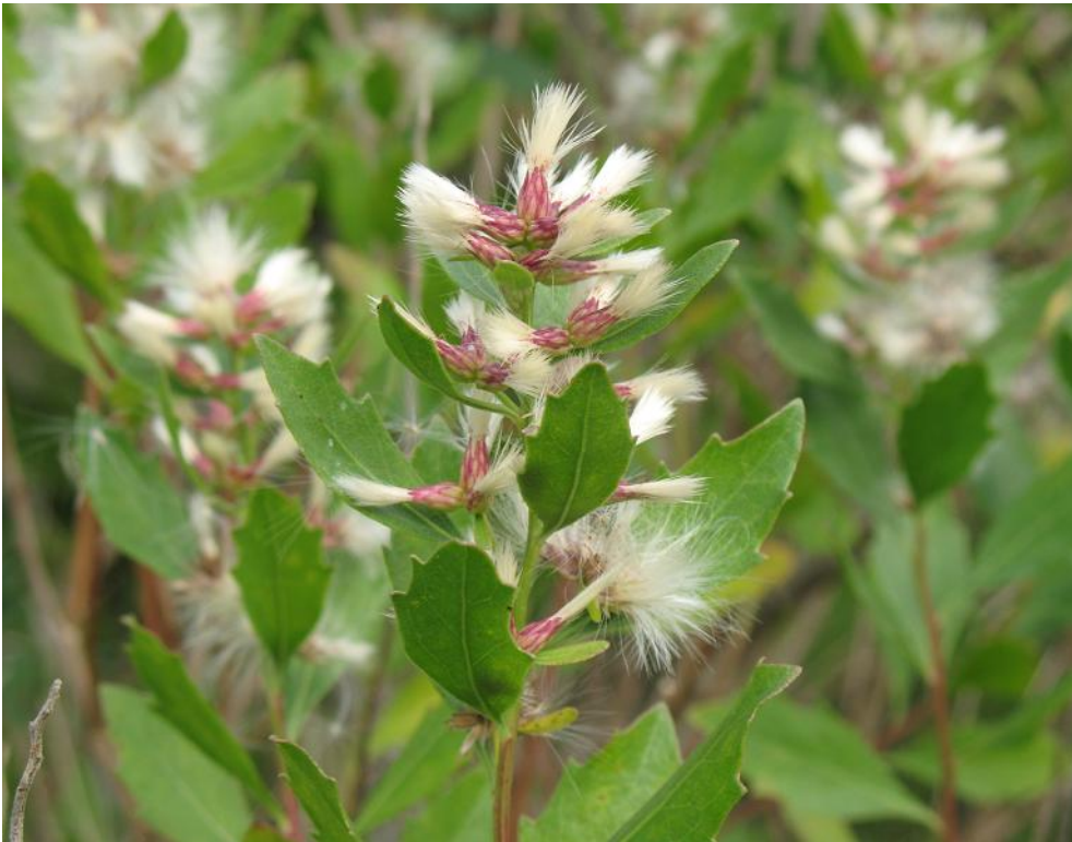
Figure 2. Upper leaves and fruiting pistillate flower heads of Eastern Baccharis ( Baccharis halimifolia ). Long white pappus bristles protrude from the receptacles, giving flower heads a showy appearance.