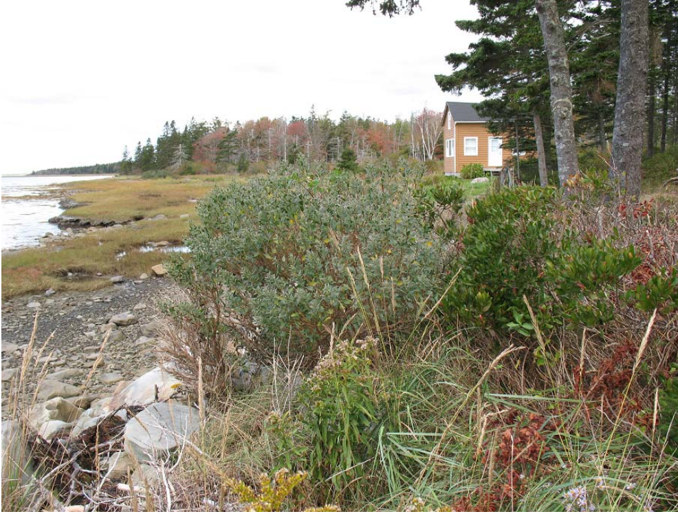
Figure 5. Eastern Baccharis (large shrub in centre, foreground) at Roberts Island, Nova Scotia, near recently built cottage which removed suitable habitat and probably some Eastern Baccharis individuals. Eastern Baccharis is also visible on the distant salt marsh margin in the upper left.