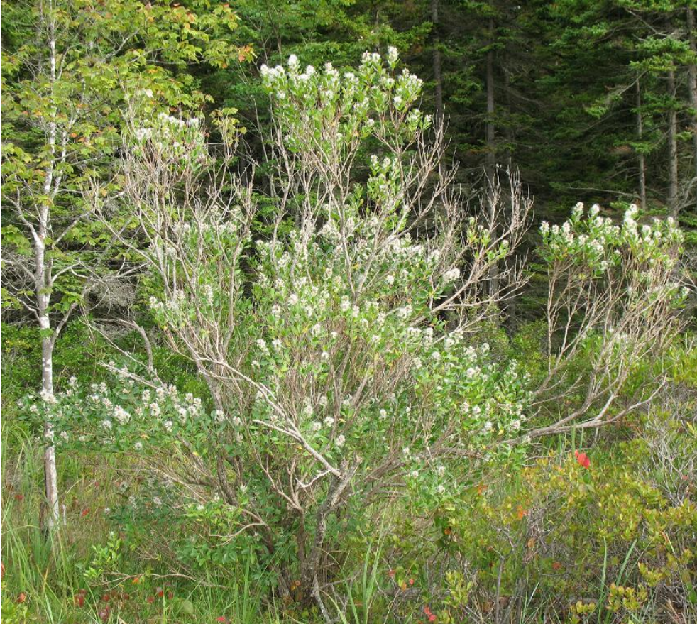
Figure 1. Large, multi-stemmed Eastern Baccharis ( Baccharis halimifolia ) shrub at the interface between salt marsh and forest, growing in association with Black Huckleberry ( Gaylussacia baccata ), Freshwater Cordgrass ( Spartina pectinata ), Tick Quackgrass ( Thinopyrum pycnanthum – identification uncertain) and Red Maple ( Acer rubrum ).